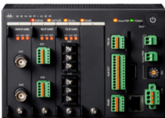
Sensing + Edge Computing Unit